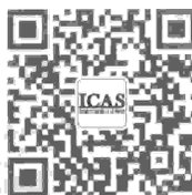
Focus on icas WeChat platform